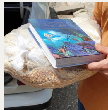
A Bible is given in each aid package.

PS: A Bible costs $6.50 and a New Testament $3.00 to ship to new believers in Iran. To ship all the Bibles currently in storage will cost about $75,000.