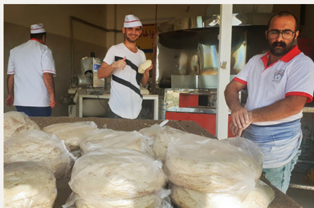
A bakery was hired to make 1200 pieces of bread for the team to deliver every morning.