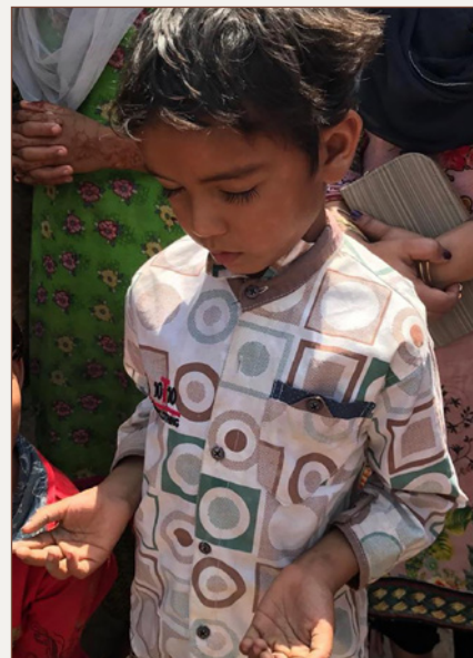
Praying for DOHI supporters who gave emergency food