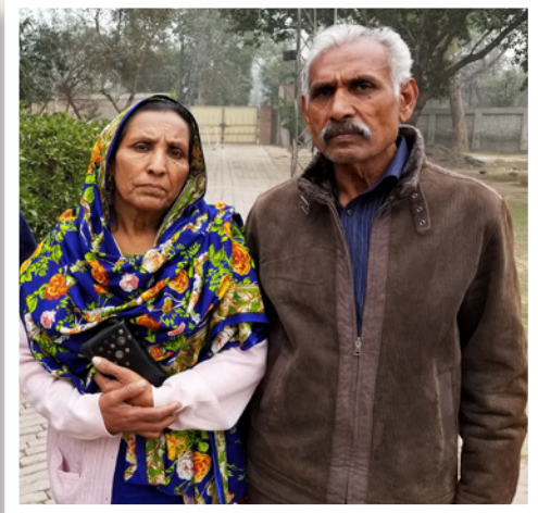
Parents of arrested son still in prison for three years. Their grief is immeasurable.